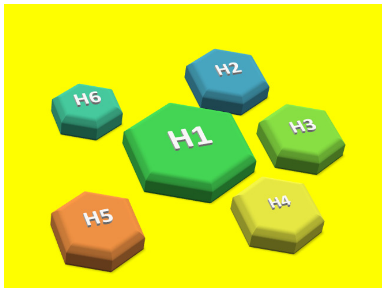
Figure 1: Classification of inmate groups in each prison zone

The Figure 1 shows example of the different size of Thai inmates group in each prison zone. The 'H1' represents the biggest 'Home' which has the largest number of members. In general, each 'Home' is independent from each other however the biggest 'Home' (H1) has significant power over other 'Homes' (H2 to H5).