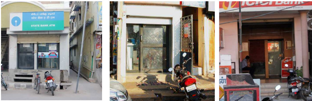
Figure 4: Well-lit ATM facility (vs.) Poorly-lit facility