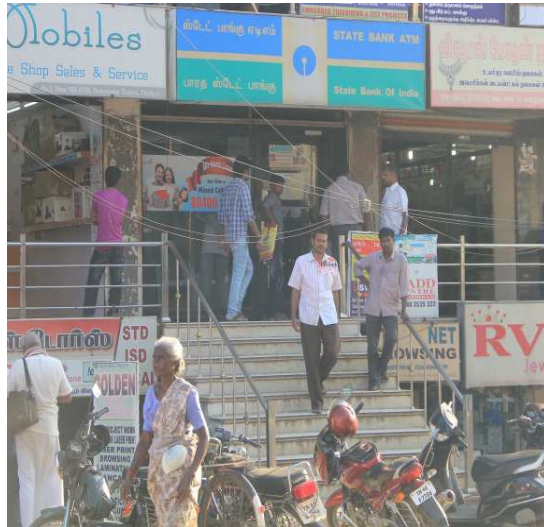
Figure 6: ATM deployments disliked by female ATM users due of its presence in male-dominated or lonely areas